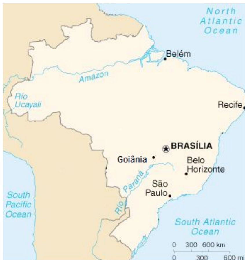
Figure 1 - Survey Locations

As expected in a survey of Brazil, the questionnaire was written in Portuguese and received the title “A Organização da Sociedade Civil no Brasil” (The Organization of Civil Society in Brazil). This is different from the title used in the previous publications, “Cross-National Survey on Civil Society Organizations and Interest Groups (country),” because, after considering the usage of certain expressions in Portuguese, it was concluded that the term “interest group” would invite misunderstandings. As a result, this term was dropped from the title, and a simpler title was chosen to avoid unnecessary confusion. The title of this report, however, being part of a comparative study among countries, maintains the standard title mentioned above that have been used in all previous reports. Also, as explained earlier in this section, the abbreviated name was chosen as JIGS preceded by the first letter of the country’s name. Furthermore, in order to avoid confusion with Bangladesh, Brazil is represented by the first two letters of her name, BR.