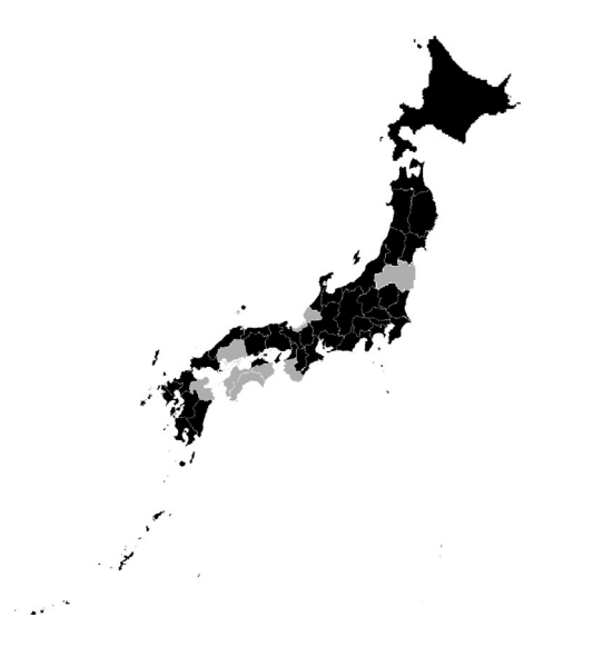
FIGURE 2 The prefectures of Japan which the responses were obtained. Black indicates at least one patient was present in the prefecture, and gray indicates responses were obtained, but 0 patient present. Gray prefectures are Fukushima, Fukui, Hiroshima, Tokushima, Wakayama, Kochi, Ehime, and Oita, from north to south

regional medical care support hospitals, clinics, healthcare centers, and others (included research institutes and unanswered). The majority of the reported patients were under care of one of the following: university hospital, general hospital, or special functioning hospital (Figure 3).