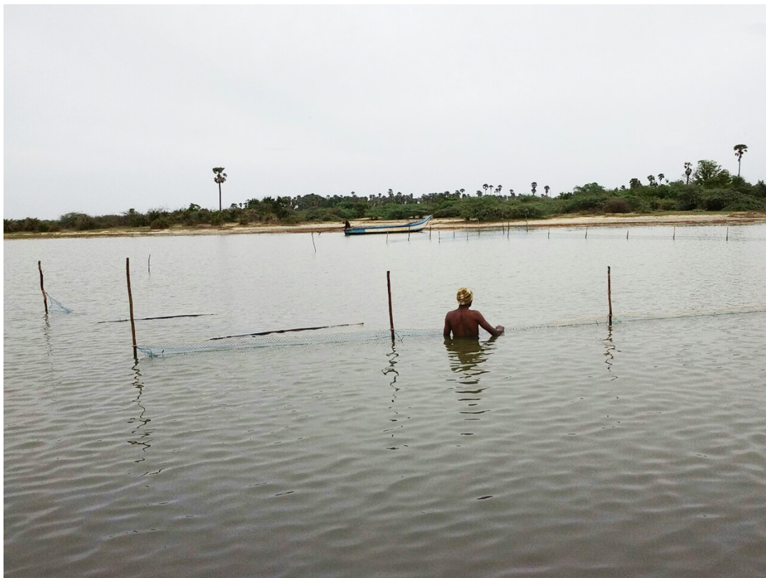
Figure 2: Padu local fisherman fixing his net

century temple was damaged in 2013 and was left in ruin due to unprofessional conservation practices by the local government (Parthasarathy 2013). The protected cemeteries in the Pazhaverkadu village, dating from 1639 to 1850 AD, are considered to be the largest in Asia, bearing testimony to the history of the cotton trade, while Chinese jars and porcelain wares highlight the villages' magnificent trade and cultural links with East Asian countries, including Japan. The first European fort was established in the Pazhaverkadu village by the Portuguese who arrived in 1502, but it was destroyed and rebuilt as Fort Geldria by the Dutch starting in 1602. However, the Dutch fort was completely demolished by the British in 1825 AD and left in ruins. Now it is covered with thorny bushes and is inaccessible.