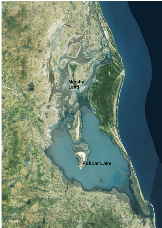
Figure 3: Satellite picture of Pulicat Lagoon

individual states to form local wetlands authorities. The decision-making power has been delegated to the state governments so that protection and conservation can be done at the local level. Tamil Nadu and Andhra Pradesh states have independent departments to manage their respective parts of the Pulicat Lagoon.