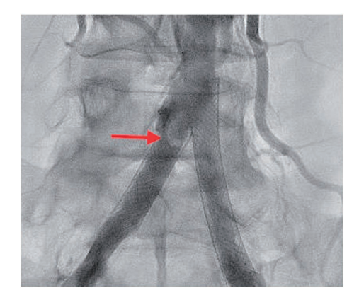
Fig. 1 Aortography shows mobile translucency within the Wallstent in the right common iliac artery (red arrow).

We scheduled femoral-popliteal artery bypass surgery for dealing with the SFA stenosis. However, we did not schedule treatment for the thrombus, because it and its stalk could not be released and distally moved. Moreover, we deemed the thrombus to be too large to remove using