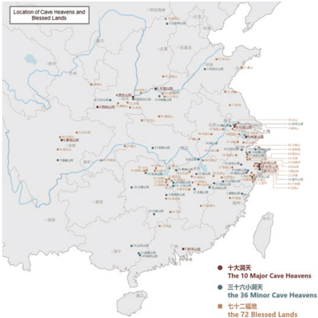
Figure 2: Locations of Cave Heavens and Blessed Lands.

rich soil and graceful landscape allow people who inhabit them to attain immortality, or at least good health and longevity. Therefore, a “Blessed Land” is a concept that can be applied to other places besides just the 72 “Blessed Lands”. In fact, there are 88 recorded “Blessed Lands” in different ancient documents.