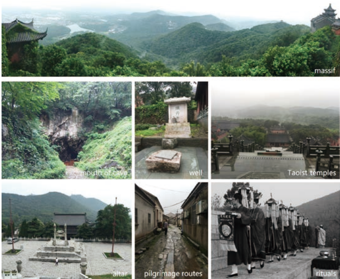
Figure 5: Sacred Compositions of Mt. Juqu (Huayang Cave Heaven), the 8th Major Cave Heaven.