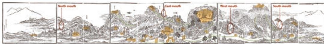
Figure 4: Drawing of Mt. Juqu (Huayang Cave Heaven), the 8th Major Cave Heaven. Source : Base map: Maoshan Chronicle 茅山全志, Qing dynasty (1623-1692). Illustrated by the author in May, 2018.