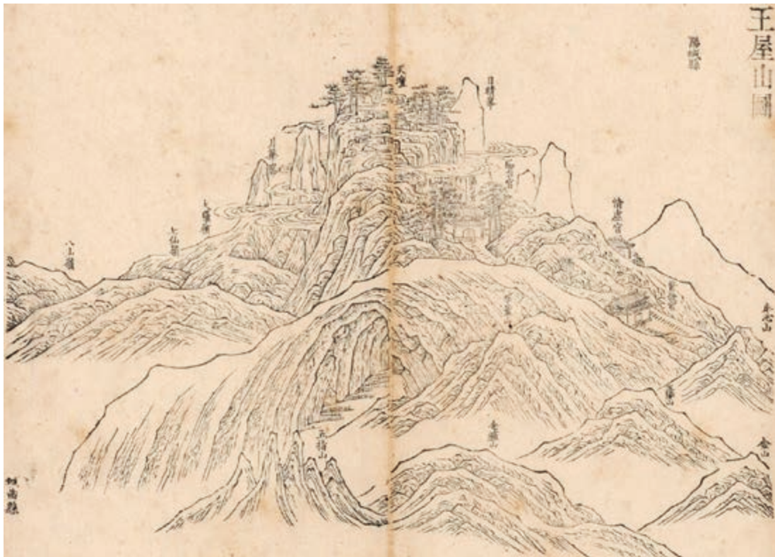
Figure 1: Drawing of Mt. Wangwu 王屋山图, the 1st Major Cave Heaven. Source : Drawings of Famous Mountains in the World 天下名山图, Qing dynasty (1644-1912).

were a link to the world of immortals derived from the ancient Chinese belief that immortals resided in Mount Kunlunshan 昆仑山 (the ideal centre of Heaven and Earth in Ancient Chinese cosmology) and the “Three Immortal Mountains on the sea in the Warring States Period” (475 B.C.-221 B.C.). These immortal mountains could not be reached in reality.