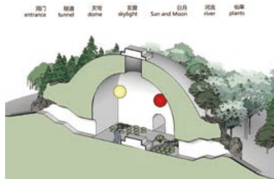
Figure 3: Ideal Model of the Cave Heaven.

Since the portals of a “Cave Heaven” were important to people, the early Taoists used to live beside the entrance where they set altars to worship Taoist immortals living in this area. Gradually, these altars became building complexes that, over time, became sacred historical sites [Fig. 4, Fig. 5]. Similarly, the existing “Blessed Lands” became Taoists’ sacred sites for the cultivation of vital energy, surrounded by abundant resources and gifted with scenic beauty.