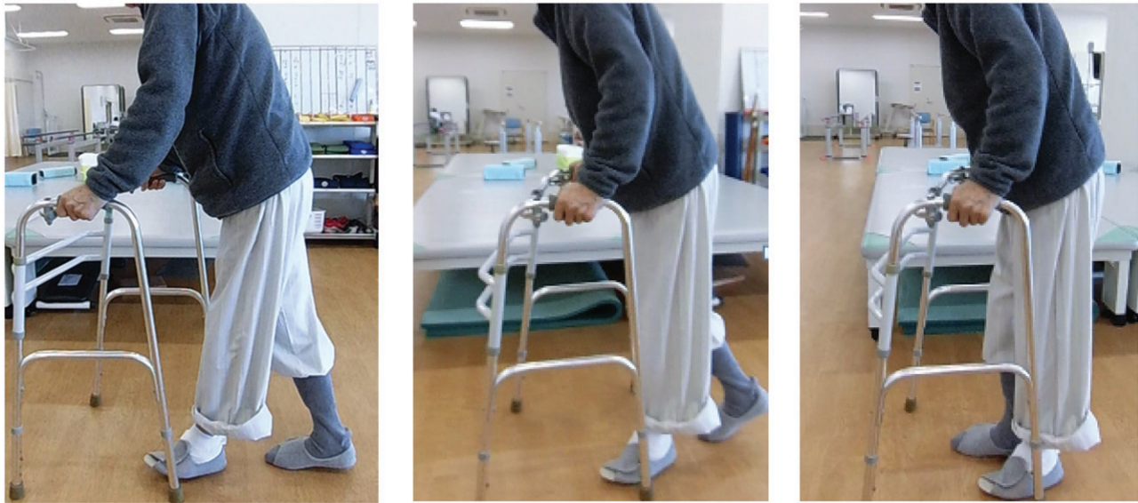
Figure 3. Treatment outcome at one post-operative months. The Barthel Index improved from a score of 45 to 80, and the patient started to walk using a four-point walker.

and additional surgical management was unnecessary. After rehabilitation exercise, as of one post-operative months, he became able to stand with assistance when moving from a wheelchair, walk using a four-point walker, and his Barthel Index improved to a score of 80 (Figure 3(b)).