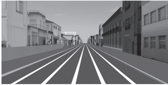
Figure 3: Road E