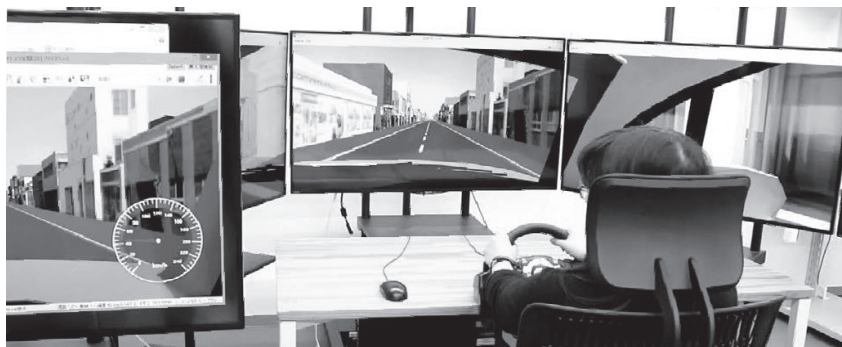
Figure 1: Experiment design

We used the "UC-win/Road Ver.10 DS" driving simulator to examine designs that would influence vehicle deceleration, specifically road pavement design. Subjects watched the monitor, which simulated driving on roads of various designs (Figure 1).