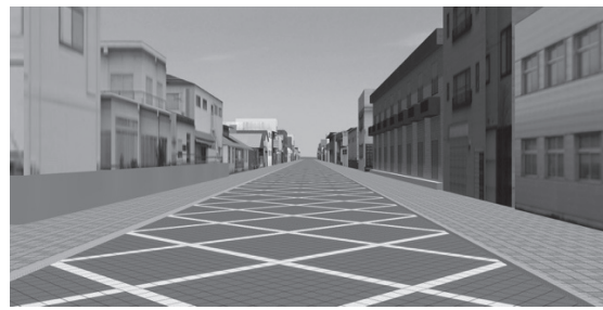
Figure 4: Road J

Table 3 shows the difference that each design element had on vehicle speed. It shows that line direction and pattern size have significant effects on driving speed ( p < 0.01 ). In the case of roads with the same patterns and different pavement materials, such as E and H, F and I, and G and J, the speed on interlocking road was lower than that on asphalt road, though these show no significant differences. The youngest and oldest subjects showed a higher speed tendency, and the middle-aged subjects showed a lower speed tendency.