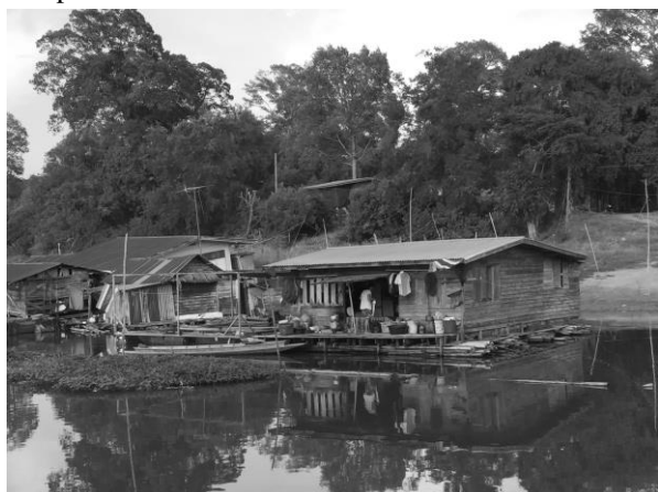
Figure 4 Raft house of Sakeakrang River

up and down the river. Due to the temporary nature of the raft house, it can easily be destroyed. Since 1945 the raft house clusters in Bangkok have disappeared (Denpaiboon et al, 2000). Only four authentic raft house clusters were accepted as traditional settlements under threat.