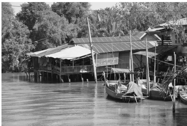
Figure 8 Leam yai fishing village

along the canal network, connected to offshore fisheries and 'Krateng'. The 'Krateng' architecture involves a wooden shelter for local fisheries built on high stilts to monitor the cockle farms. However, most of the remote and isolated 'Krateng' are currently used by tourists as an exotic destination.