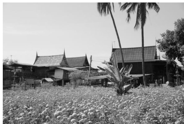
Figure 3 Paddy village of Bangbaan community

Granary stores, barns, and other agricultural related structures (including fish trapping) are the main features of the community cluster. The agricultural activities associated with housing and the environment were built using vernacular and/or a traditional Thai house structure, on land with a raised floor on high stilts. The houses were clustered around the community space which contained a Buddhist temple.