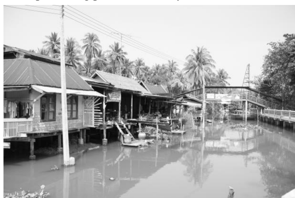
Figure 7 Pradoo canal Orchard village

The Orchard village combined orchards, shophouses, row houses, and a market. The clusters subsisted on the agricultural activities of the orchard landscape complex which exerted influence on material cultural design. Dispersed settlements were associated with the orchardist agricultural landscape and salt paddy agricultural areas. Land use and area consumption based on function illustrated a long distance association between agricultural areas, processing plant, community, and market.