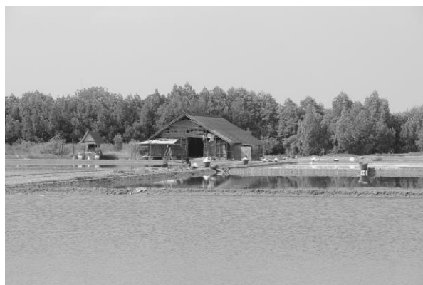
Figure 6 Estuarine agricultural village of Bangkeaw salt paddy

features of the Estuarine agricultural village. The community of single-centric wooden houses were built on land and clustered around a Buddhist temple, surrounded by agriculture.