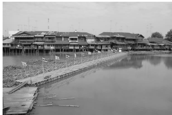
Figure 2 Riverport town of Sriprajan community

where the public pier is located at the waterfront. The cluster is settled in single-centric (nucleated) plan surrounded by agricultural areas of paddy fields and post-agricultural products (rice mills) and the center for trading along the main river. The settlements are along the main transportation route running through the north-south corridor of the Chao Phraya River and influenced by activities for economies of scale.