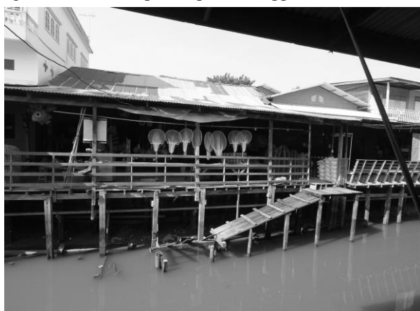
Figure 5 Canal trading village of the Raheang canal

Typical single-floor wooden row houses were clustered on the east-west corridor of the lower basin. The houses were positioned along one-side or both-sides of the waterways of the commercial hub. The cluster was built adjacent to the canal, with the walkway running in-between. This corridor served as a common/shared veranda, one of the smallest public spaces, and connected to the row houses. Functionally, the housing combined a shophouse and residential unit, connected to the agricultural landscape and product suppliers at the rear.