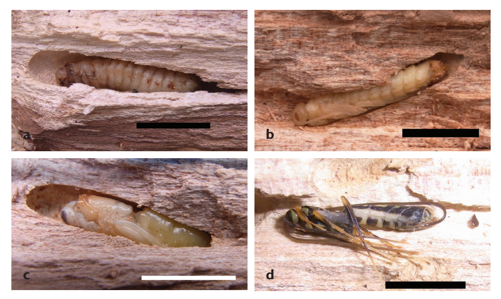
Figure 4. Hymenopteran insects found in S. macrophylla. a T. apicalis prepupa b pupa of T. apicalis female c I. japonica pupa d pupa of M. sp.1 female. Scale lines = 10 mm.