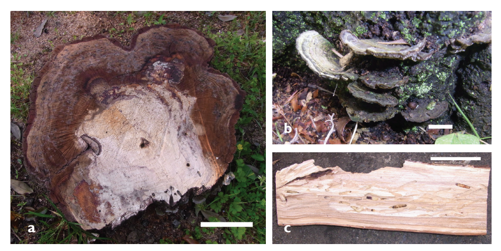
Figure 3. S. macrophylla wood infested with T. apicalis. a Wood discoloration in the cross section with T. apicalis infestation b Basidiocarp of Cerrena unicolor in the wood infested with T. apicalis c Longitudinal section through stem of the wood infested with T. apicalis and woodwasp larvae, pupae and larval tunnels. Scale lines = ( a , c ) 100 mm; ( b )10 mm.