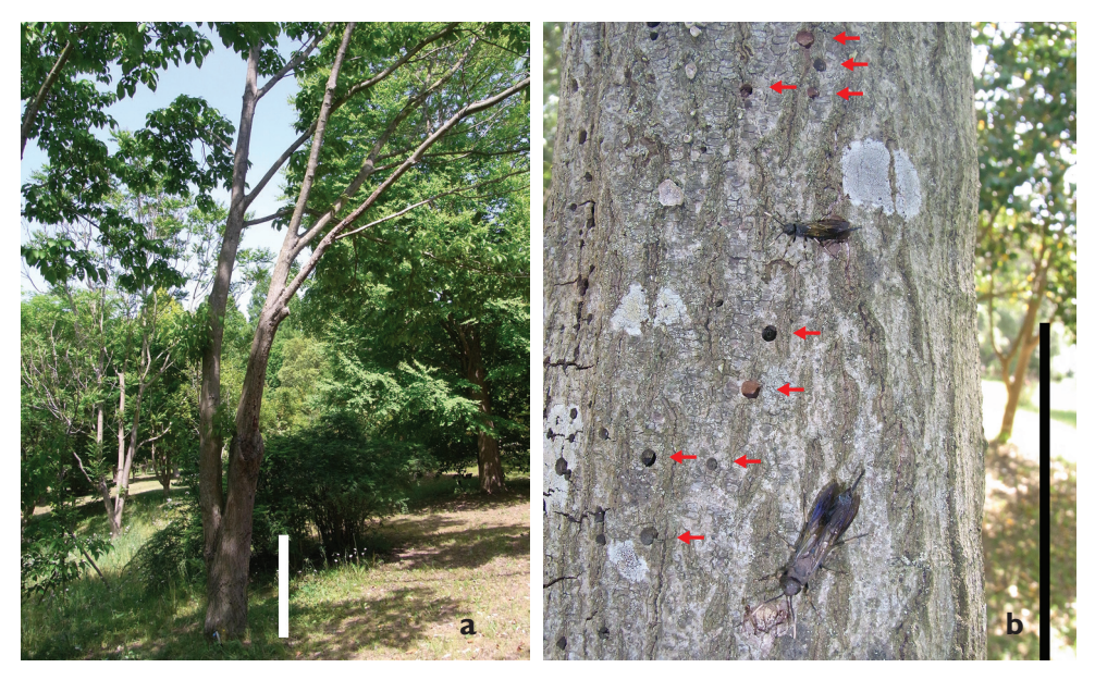
Figure 1. Infested Swida macrophylla at Botanical Garden, University of Tsukuba, Honshu, Japan. a a decayed S. macrophylla infested with T. apicalis b T. apicalis adults and their emergence holes (red arrows) on the tree trunk. Scale lines = ( a ) 100 cm; ( b ) 100 mm.

Voucher specimens are deposited in the Laboratory of Applied Entomology and Zoology, University of Tsukuba (Tsukuba City, Japan) and Kanagawa Prefectural Museum of Natural History (Odawara City, Japan).