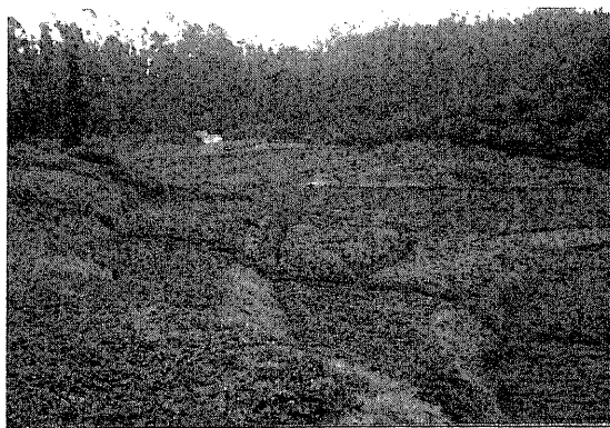
Bench Terraces in Hills