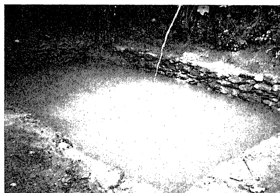
Water Harvesting Tank on Hill Slopes