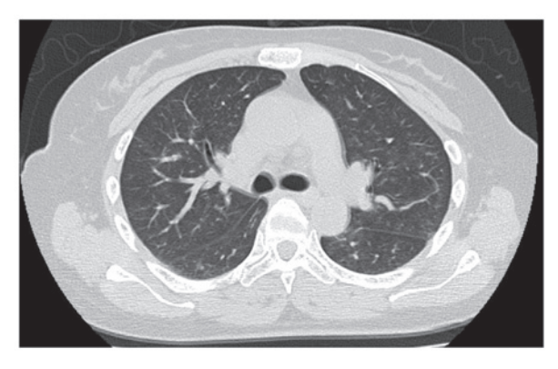
Figure 4. Chest computed tomography scan 2 weeks after the initiation of steroid therapy demonstrated the absence of the ground-glass opacities in each lung.

with consolidation (Fig. 2). Blood, sputum and urine cultures did not indicate any bacterial infections. A bronchoalveolar lavage obtained from the left upper lobe demonstrated a total cell count of 6.4x10<sup>5</sup>/ml with 53.0% lymphocytes. Despite the administration of oxygen therapy and a broad-spectrum intravenous antibiotic, levofloxacin, the patient's respiratory condition progressively deteriorated within a few hours of admission. Considering the possibility of medication-induced lung injury, all medications were withdrawn, including bofutsushosan. Due to the rapid deterioration of the patient, methylprednisolone pulse therapy (1,000 mg/day for 3 days) was initiated. The respiratory condition of the patient improved in response to the pulse therapy and the chest CT scan, which was performed 2 weeks after initiation of steroid therapy, showed that the GGOs in each lung had disappeared, although dense consolidations remained in certain areas of the lungs (Figs. 3 and 4). The patient was discharged without oxygen inhalation. Maintenance steroid therapy using prednisolone was tapered off within 3 weeks, and a relapse requiring oxygen therapy did not occur. The patient's respiratory condition remained stable 1 year after this occurrence of acute respiratory failure.