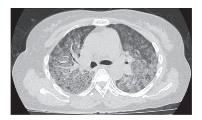
Figure 2. Chest computed tomography scan at the time of admission exhibited bilateral ground-glass opacities.