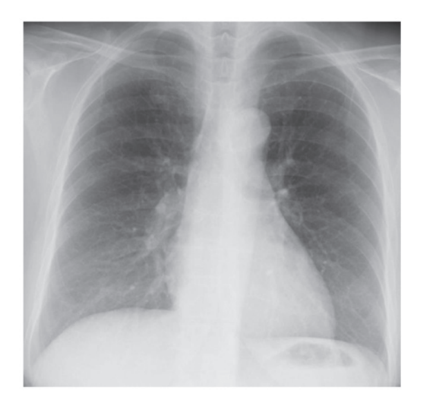
Figure 3. Chest radiograph 2 weeks after the initiation of steroid therapy demonstrated the absence of the ground-glass opacities in each lung.