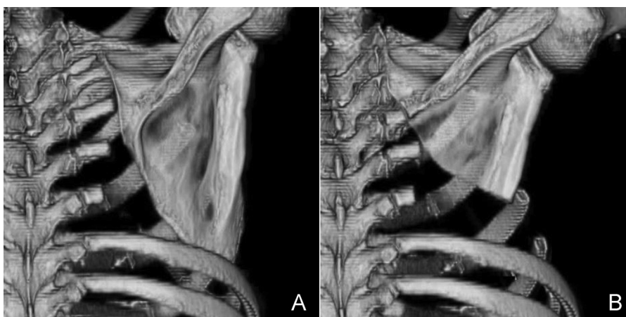
Fig. 2. A: Computed tomography image after the initial lobectomy, with chest wall resection, showing that the scapula tip had fallen into the thoracic cavity. B: Excised scapula prevents it from falling into the thoracic cavity.

The scapular tip of the subscapularis muscle was lifted and its lower half was dissected using electric cautery. The pedicle was attached to the upper half of the scapula (Fig. 1A). The same parts of the infraspinatus and teres major muscles were also dissected from the scapula. Subsequently, the lower third of the scapula was excised using a sternum saw. The size of the subscapularis muscle flap was adequate to cover the defect. The free end of the flap was sutured to the stumps of the anterior serratus and rhomboid major muscles, which had been cut during the initial surgery (Fig. 1B).