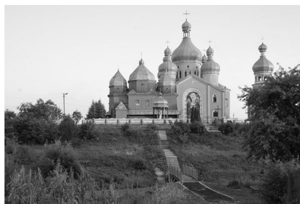
Figure 5. Newly built church next to the St. John Church (1777) in Pobuzhany village

Hasty attempts to rescue disappearing wooden churches in the times of Soviet iconoclasm led to rather arbitrary designations that made up an unmanageably large register of heritage at the highest level of protection, while leaving many comparable properties behind. This arrangement allows us to test the current heritage protection policies by comparing the samples of the