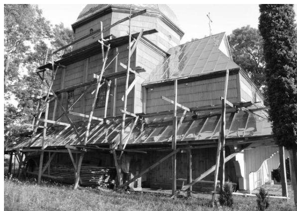
Figure 4. Replacement of claddings on the Ascension Church (1660) in Volytsya-Derevlyanska village (photo by A.Bogdanova, July 2015)

the surveys of Hromyk and Slobodyan, supplemented by the direct inquiries to the village councils.