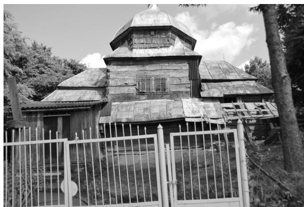
Figure 2. Wooden church of the Blessed Virgin Mary (1724), Loni village (photo by

historical by the interruption in church use during the Soviet era. Therefore, exterior repairs with materials that were used for this purpose before the Soviet era are considered as conservative; while exterior repairs incorporating materials that were not used or even did not exist prior to the Soviet era, are considered modernizing. The list of materials newly adopted for wooden church cladding includes manufactured wooden panels, plastic panels, fiberboards, metallic shingles and metal sheets made with a new technology of titanium nitride coating (TiN). Additionally, any replacement of original elements (doors, windows, or crosses), or structural additions and alternations made to church silhouettes also fall under the category of modernizing repairs (Fig. 3). All these actions are strongly opposed by the heritage protection authorities and the general public, and are forbidden by the historical properties restoration guidelines of the State Construction Norms of Ukraine (B. 3.2-1-2004).