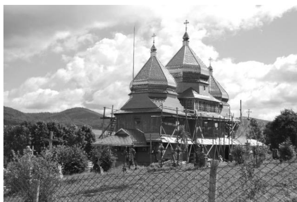
Figure 3. Modernizing repairs on Michael the Archangel church (1724), Smozhe village (photo by A.Bogdanova, July 2015)

As described above, the restoration of walls or roof cladding with materials that were used for this purpose prior to the Soviet era are considered conservative repairs. These include such materials as wooden shingles, boards, and board-and-batten for the wall cladding, and wooden shingles or galvanized (zinc) sheet metal for the roof cladding (Fig. 4). Unlike modernizing repairs, conservative actions are not always evident from a visual analysis. Galvanized metal roofs or board coating on walls can last a long time and look like new if installed properly and regularly cared for. Since this analysis is limited to the church ownership by religious communities, it is important to know whether the church was repaired by the present community or only maintained in its previous state. Therefore, here we have relied on the textual evidence in