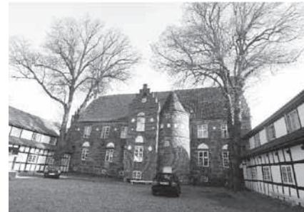
Fig1. Old Manor Farmhouse