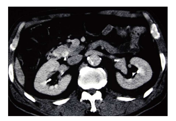
Figure 1 Abdominal computed tomography angiography image of the common bile duct. Thickening of the wall of the distal common bile duct, which enhances with contrast, was observed (arrowhead).

Tumor cells were detected in the distal bile duct upon microscopic examination (Figure 3). According to the UICC guidelines, the pathological classification of the tumor was cT2N0M0 Stage I B. The patient was discharged on postoperative day 61 in good condition.