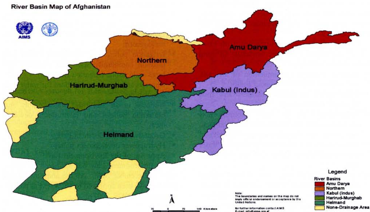
Fig. 1. Map of Five Major River Basins

At present, 70% of the urban population and 80% of the rural population have no access to potable water. Most people suffer from a shortage of water for domestic use. The efficiency of water supply systems in cities and rural areas is 50%, owing to the lack of maintenance and the shortage of power for their operation. In spite of the efforts of the government and international organizations,