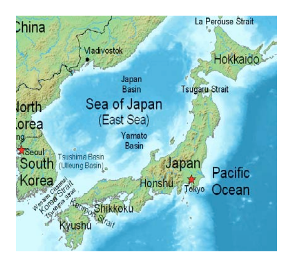
Figure 2: Map of Japan

In the light of the final fragmentation in the case of the South Slavic languages, even if we do not take into account Japan's fragmented 'mediaeval' history with wars, switching allegiances, etc., unification of the area under its rule and the creation of a modern nation state with a single national language permeating every pore of society was no mean feat for the Meiji regime.