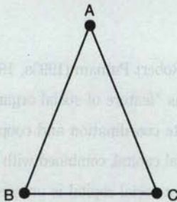
Figure 2: Three-person structure: human capital in nodes and social capital in relations

Social capital in turn is created when the relations among persons change in ways that facilitate action. Physical capital is wholly tangible, being embodied in observable material form; human capital is less tangible, being embodied in the skills and knowledge acquired by an individual; social capital is even less tangible, for it is embodied in the relations among persons. Physical capital and human capital facilitate productive activity, and social capital does so as well.