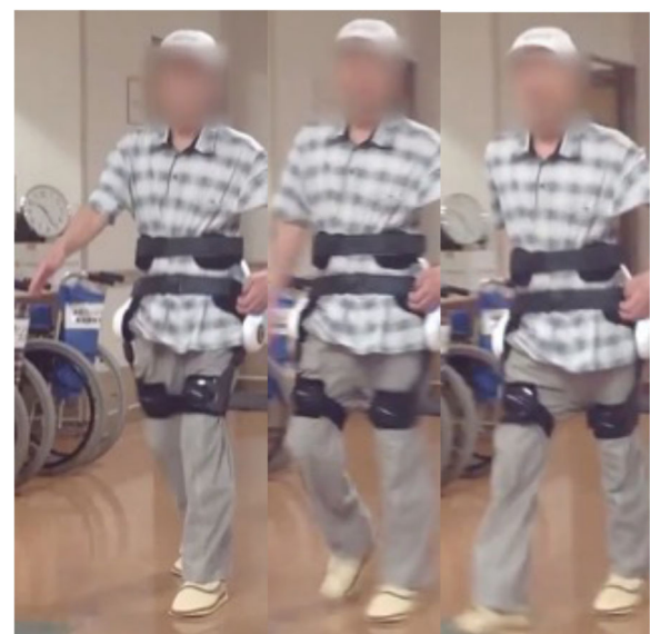
Fig. 4 Continuous gait training on the ground with the lumbar type HA