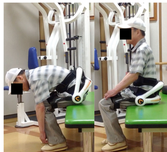
Fig. 3 Repetitive lumbar flexion and extension training with the lumbar type HAL

We prospectively enrolled 33 participants (16 men, 17 women) with locomotive syndrome in the present study. Their mean age \pm SD was 77 \pm 10 years (range, 40–95 y), their mean height \pm SD was 155 \pm 7.6 cm (140–178 cm),