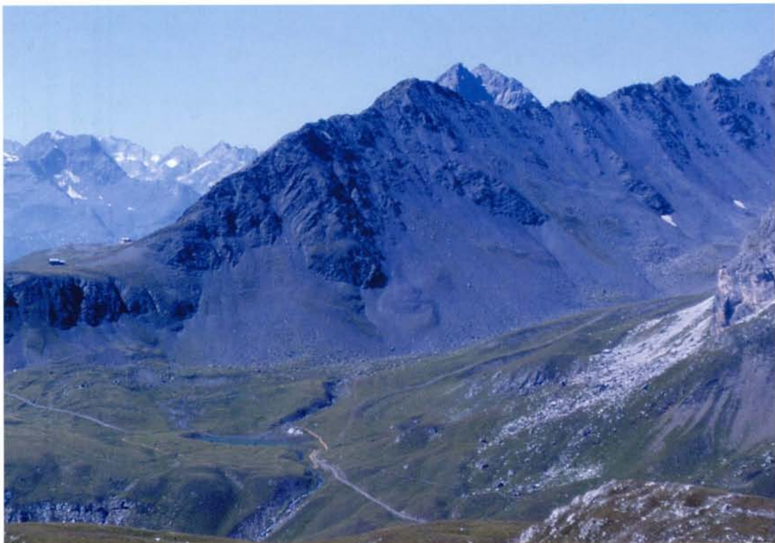
Fig. 2. Pebbly rock glaciers below shale rockwall, Corviglia, Swiss Alps.