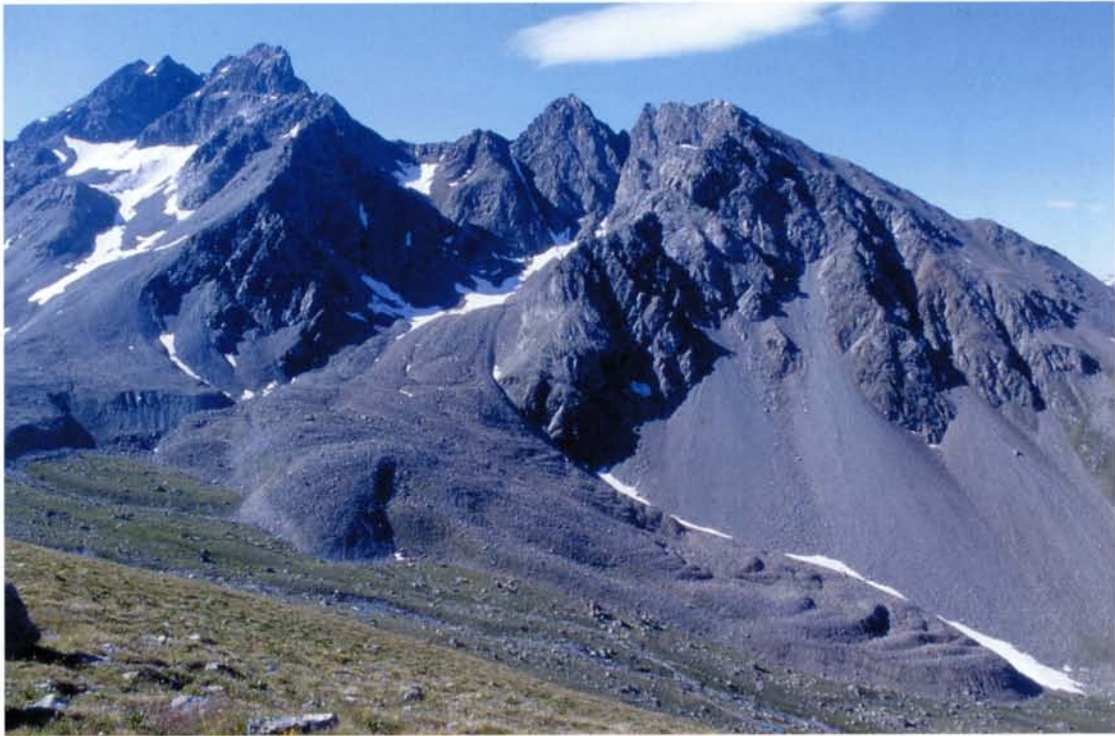
Fig. 1. A bouldery rock glacier below gneiss rockwall, Muragl, Swiss Alps.