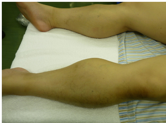
Fig. 1. One hour postoperatively, the patient complained of severe cramping-type pain, swelling and serious tenderness on palpation in both legs.

Compartment syndrome is a well-known abnormal injury. However, it remains not widely known that compartment syndrome develops not from injury, but as a result of "abnormal" positioning of the limbs. Since the calf compartments are the most commonly affected, the term WLCS is used to describe this syndrome [1]. The overall incidence of WLCS in patients after major pelvic surgery in the lithotomy position is estimated to be 1 in 3500 cases [2]. The lower limb consists of four main compartments: the anterior, lateral, superficial and deep posterior compartments. These regions are bordered by strong, inelastic fascial layers or bone, and through each run neurovascular structures [3]. WLCS is caused by pathological elevation of the intra-compartmental pressure within the non-expansile tissue envelope [4]. A reduction in the blood perfusion pressure causes tissue ischemia. Ischemia may be followed by reperfusion with subsequent capillary leakage and