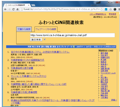
Fig. 3. Example search results