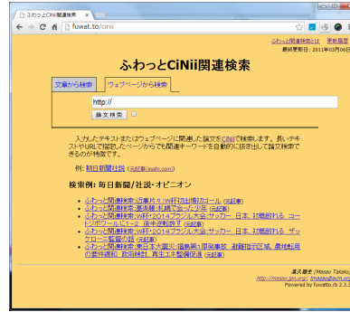
(b) URL query