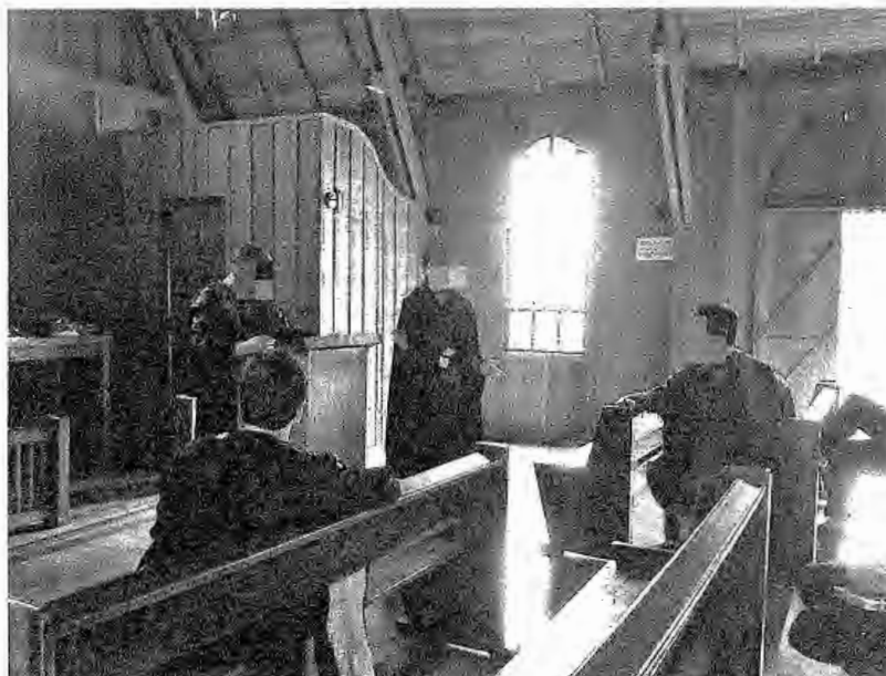
Figure 4. A scene from the medieval fantasy larp Fallen Fane.

decade, especially in the European Nordic countries like Sweden, Denmark, Finland and Norway (Saitta, Holm-Andersen, & Back, 2014).